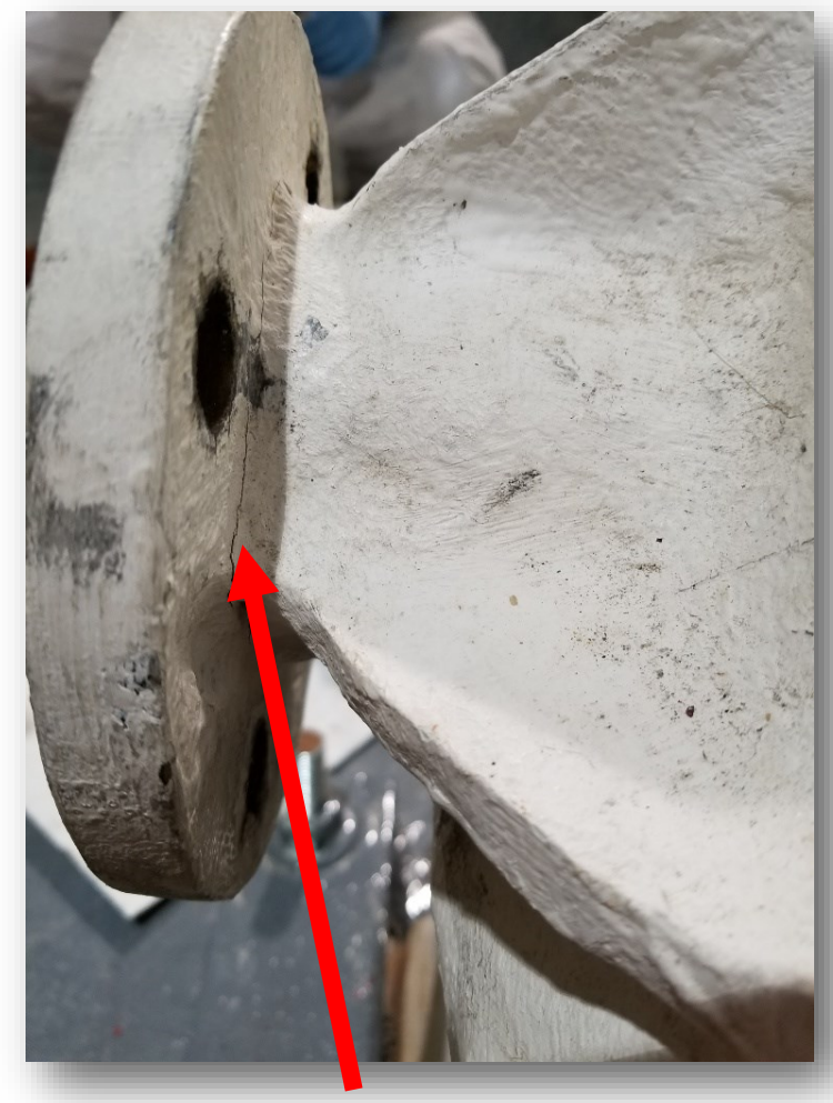
Small hair line crack at the flange to pipe transition.

A customer at a semiconductor manufacturing plant needed to have a flange repaired in a short period of time. The crack is assumed to happen when the mechanical contractor over tightens the bolts on the flange. The nozzle was not put in service, but was noticed and wanted to be fixed prior to putting the tank back in service.